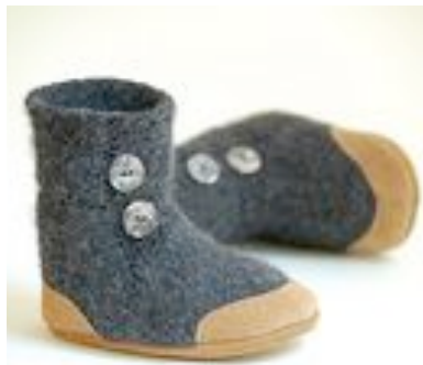
Slippers by Woolly Baby Available for purchase at the First Friday Craft Market